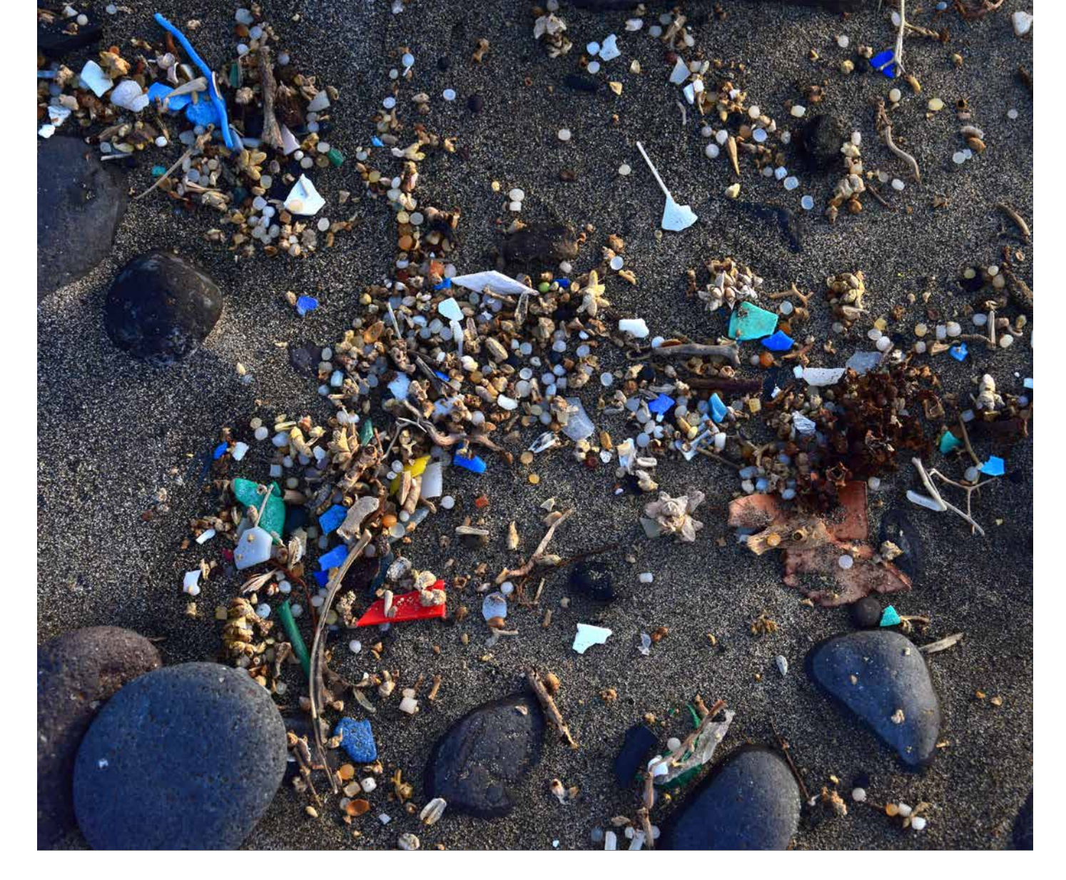
Pillar 2: Plastic pollution prevention

The overarching objectives of the Convention on Plastic Pollution are: