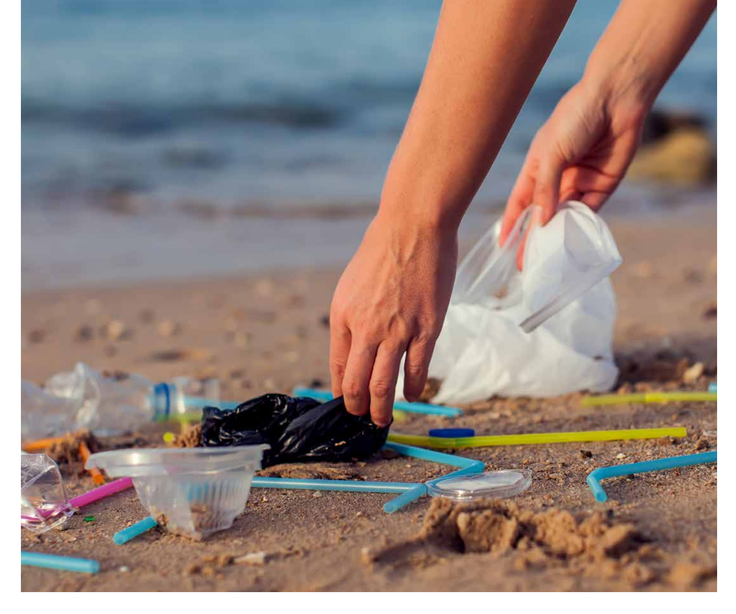
Pillar 1: Monitoring and reporting

An essential element in any multilateral environmental agreement is monitoring and reporting.